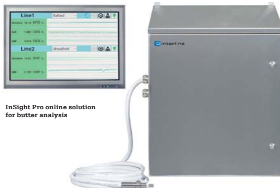
InSight Pro online solution for butter analysis

cabinet, protecting it from influences from the surroundings and providing stable analyzer conditions. Results are presented on a touch screen monitor placed in an IP65 cabinet directly at the production line where the results are needed.