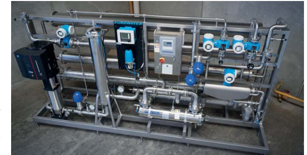
EUROWATER custom-made reverse osmosis unit in sanitary design for Danone Ukraine.

SILHORKO-EUROWATER has more than 80 years of experience within the fields of developing, manufacturing, selling and servicing complete water treatment plants for the food and beverage industry, heat and power plants, waterworks, hospitals and other industries. The main applications are product water, boiler water, process water, cooling water, rinse water and drinking water. SILHORKO-EUROWATER has almost 400 highly qualified employees at 23 sales and service offices around Europe. For more information, please visit www.eurowater.com